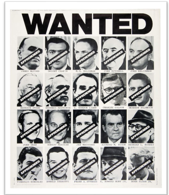
Wanted poster of Watergate conspirators

On May 28 and June 17, 1972, seven operatives from the Committee to Re-Elect the President (CREEP) broke into the headquarters of the Democratic National Committee, located in the Watergate complex in Washington, D.C. During the second of the two break-ins, five of the burglars were arrested while attempting to wiretap telephones and steal sensitive documents.