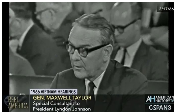
Gen. Maxwell Taylor.

than by the most stubborn pursuit of extravagant or unpromising objectives.” 24 Mr. Kennan’s testimony was later seen as one of the turning points in the hearings’ impact on U.S. public opinion, encouraging the public to begin to question and criticize the war in Vietnam.