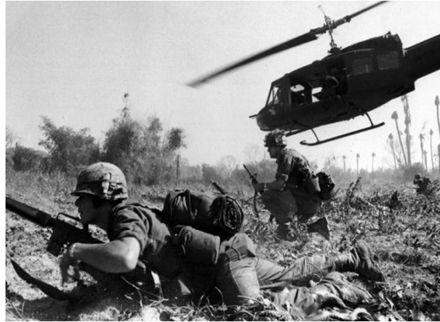
U.S. troops in Vietnam (Source: U.S. Dept. of Defense).

From 1966 to 1971, the Senate Foreign Relations Committee held a series of oversight hearings that questioned the justification, tactics, and effectiveness of the U.S. military in the Vietnam War. Popularly called the “Fulbright hearings” after its chair, Arkansas Democrat Senator J. William Fulbright, these televised congressional hearings educated Congress and the American public about unknown facts, forced greater scrutiny of U.S. military actions, exposed misrepresentations by the executive branch, and helped shift public opinion against the war. The hearings illustrate the powerful role that congressional inquiries can play in informing the public about their government and shaping public opinion.