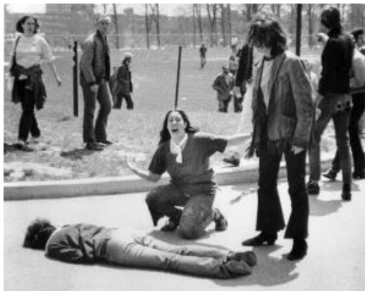
Kent State Massacre.

By the end of 1969, U.S. troops in Vietnam had surpassed 500,000, nearly thirty thousand had died in the war, and a significant anti-war movement had gained force. Demonstrations spread to college campuses. On May 4, 1970, after President Nixon disclosed expanded military operations in Cambodia, National Guardsmen opened fire on Ohio Kent State University students engaged in an anti-war protest, killing four and wounding nine. On May 15, 1970, at Jackson State University in Mississippi, police shot and killed two students and wounded twelve.