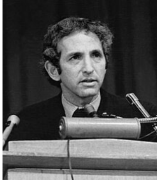
Daniel Ellsberg (Source: Wikipedia ).

27, 1971, Commander in Chief of the Veterans of Foreign Wars, Herbert Rainwater, called for the unilateral, unconditional withdrawal of all U.S. forces in Southeast Asia. 64 By presenting repeated testimony by war opponents, the hearings legitimized that point of view and educated the country about the level of internal dissent against American military actions in Vietnam.