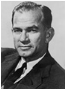
Sen. J. William Fulbright.

Sen. Fulbright was a well-known, popular senator when he launched the hearings. A foreign policy expert, he chaired the Senate Foreign Relations Committee for 16 years, from 1959 to 1974, becoming the longest serving chair of that committee in Senate history. 1 He was also part of the class of southern Democrats who, due to their Senate longevity, dominated committee leadership during those years. Sen. Fulbright compiled a complex legacy that included opposition to civil rights and integration of public schools; the establishment of the Fulbright scholarship program supporting educational exchanges between the United States and other countries; and opposition to Senator Joseph McCarthy’s Red Scare tactics in the 1950s. 2 He served with Lyndon B. Johnson in the Senate and, for years, was a friend and strong supporter of his colleague. 3