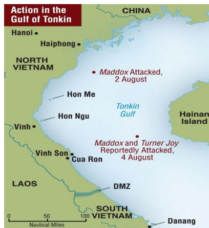
Gulf of Tonkin Incident Map.

U.S. military involvement in Vietnam started years before the Fulbright hearings began in 1966. In 1946, in the First Indochina War, Vietnamese rebel forces known as the Viet Minh, with Communist assistance, fought and expelled colonial French forces from the country. After that war ended in 1954, the Geneva Accords split Vietnam in two with a Communist-backed government in North Vietnam and a non-Communist, U.S.-backed government in South Vietnam.