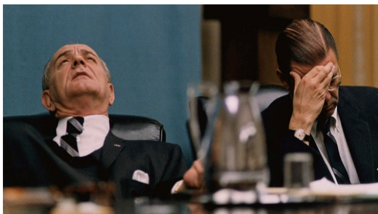
Pres. Johnson and Sec. of Defense McNamara.

Over the next year, the Senate Foreign Relations Committee held several additional hearings on Vietnam. In the summer of 1966, it held a hearing examining how U.S. agencies were interacting with journalists in Vietnam. 30 In early 1967, it took testimony from a New York Times editor who had spent two weeks traveling North Vietnam and speaking with North Vietnamese leaders. 31 In the summer of 1967, the committee addressed Vietnam-related issues during its annual hearing on the foreign aid bill. 32 In the fall of 1967, it examined legislation proposing to submit the Vietnam conflict to the United Nations. 33 The committee also held closed-door sessions on the war. 34