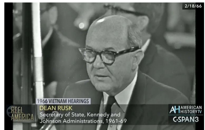
Secretary of State Dean Rusk.

Later in the hearing, Sen. Fulbright pushed back again: “[T]his isn’t the kind of conflict that warrants a vast escalation, a vast expenditure of money and many thousands of deaths.” 28