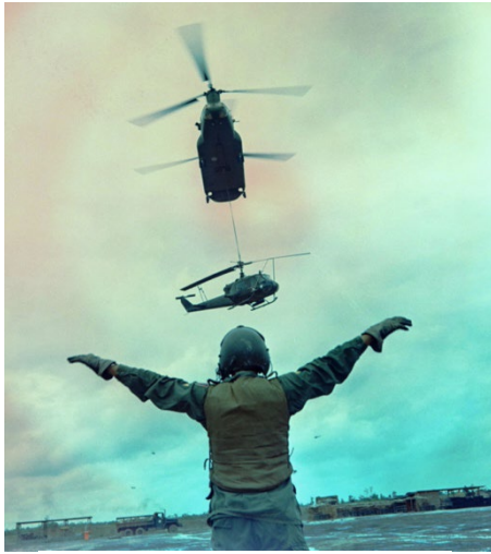
U.S. Airlift Operation, Vietnam.

endorsement of the Resolution.” 11 The Senate passed it by a vote of 88-2. 12 President Johnson signed it on Monday, August 10, 1964. 13