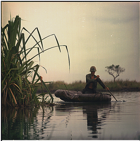
U.S. soldier on a paddleboat (Source: National Archives).

On January 17, 1968, the Senate Foreign Relations Committee staff completed a memorandum and chronology on “The 1964 Incidents in the Gulf of Tonkin.” 39 Citing evidence