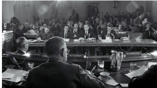
The Fulbright hearings.

By 1971, public opposition to the Vietnam War was widespread, and Members of Congress, including Sen. Fulbright, had introduced multiple legislative proposals to restrict U.S. military operations in Southeast Asia. In the spring, the Senate Foreign Relations Committee held 22 rounds of testimony with various witnesses spread across eleven days from April 20 to May 27, 1971, to examine the legislation, the latest war developments, and expert opinion on what steps the United States should take. The televised hearings heard from dozens of witnesses, including Members of Congress, administration officials, diplomats, scholars, and veterans. 56