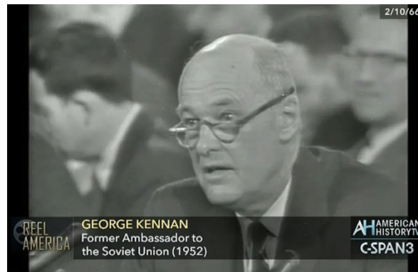
Diplomat George Kennan.

What Fulbright was trying to do was educate himself. He wanted to learn more about what these other people were thinking and what they had to say .... I think he was rather surprised that in the process of educating himself and those few members he expected would come, that [the hearings] would attract TV, press, and public attention. ... The fact they attracted attention at that time was because people were beginning to be worried. 20