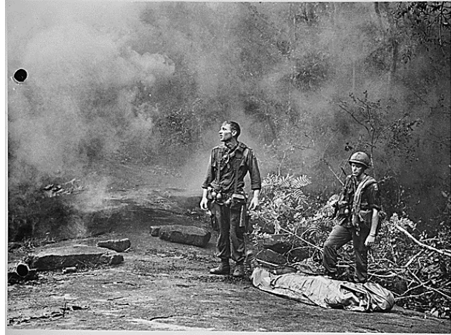
“...as if to ask why?” (Source: National Archives ).

On March 10, 1968, the New York Times disclosed that Gen. Westmoreland had called for the conscription of 200,000 more American soldiers, prompting public outcry. The next day, at a previously scheduled hearing to consider the annual foreign aid bill, the Senate Foreign Relations Committee grilled Secretary of State Rusk about possible plans to increase U.S. troops in Vietnam and whether the president would consult Congress before ordering an increase. 44 The hearing, in which Secretary Rusk was the sole witness, began at 10:00am and finished at 6:30pm. Sen. Fulbright asked him to appear the following morning as well to continue his testimony. That hearing, on March 12, 1968, lasted another four and a half hours. On March 20, 1968, the committee held still another hearing focused on Vietnam, taking testimony from a retired Marine Corps general critical of the war effort. 45