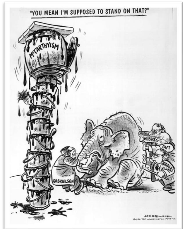
Herbert Block's cartoon in Washington Post on March 29, 1950

Senator McCarthy plowed ahead with several investigations and hearings into the State Department's foreign-language radio station, Voice of America, the U.S. Information Services Libraries around the world, and university professors. In these hearings, he rejected the value of allowing a range of political opinions in a democracy and ignored principles of academic and intellectual freedom.