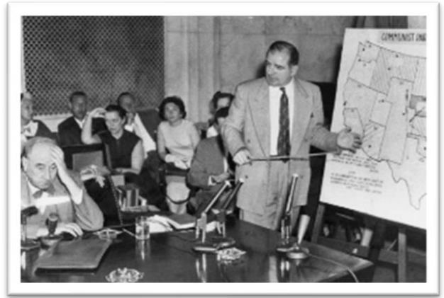
Attorney Joe Welch and Senator Joe McCarthy at the Army-McCarthy hearings on June 9, 1954

In the days following the broadcast, due to growing factual disputes and claims of bias, the other PSI members voted unanimously to remove Senator McCarthy as PSI chair for the duration of the Army inquiry. Senator McCarthy agreed to temporarily leave the subcommittee.