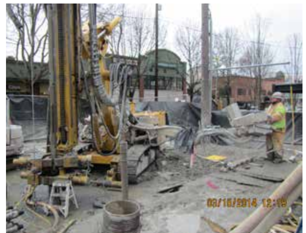
Testing underground conditions sometimes involves working in city-center locations.

Sound Transit said it considers the geological environment, engineering and construction needs, property access, contracting method, time constraints and cost-benefit analysis when planning underground investigations. It also said fully understanding underground conditions by increasing the amount of exploration is not always practical. It hires design consultants to prepare and implement