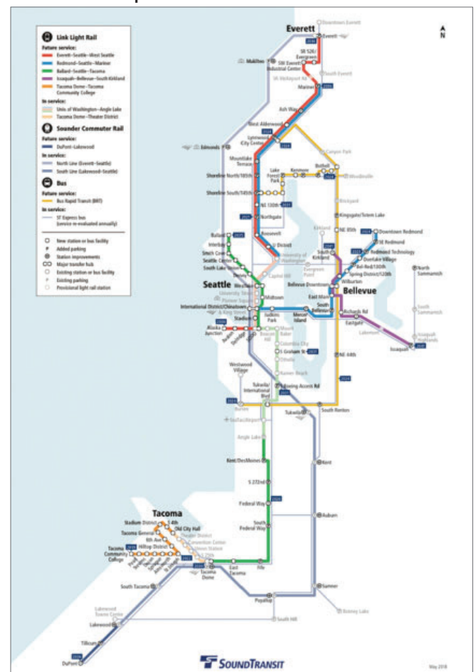
Exhibit 1 – Map showing Sound Transit’s current and planned transit lines

The most recent, and by far the largest, measure is ST3, which funds an estimated $54 billion for construction, operations and maintenance over the next 20 years. Plans for this measure include several projects to extend light rail from Seattle to Everett in the north, Tacoma in the south and Issaquah in the east. When complete, it will connect 16 cities by light rail, 12 cities by commuter rail, and 30 cities by bus in King, Pierce and Snohomish counties (Exhibit 1).