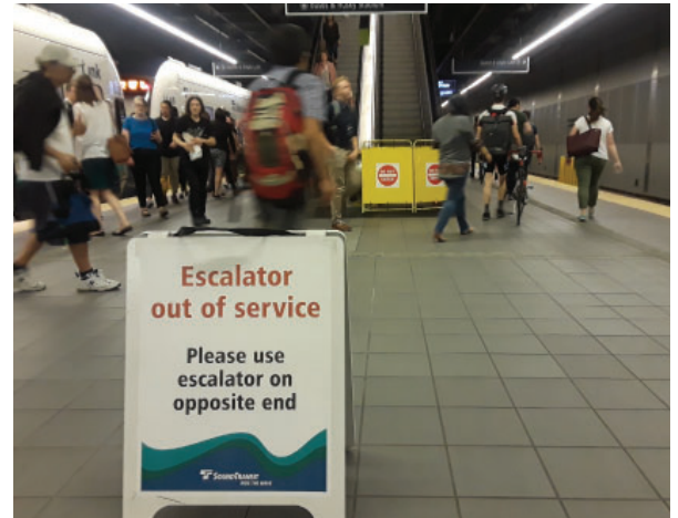
Travelers avoid an out-of-service escalator at the University of Washington light rail station.

The first example involves escalators at the University of Washington light rail station. The escalators specified in the plans and subsequently installed were designed to be somewhat more robust than a typical commercial grade escalator. Sound Transit chose these escalators because they were less expensive, but still met design specifications. However, installation issues, maintenance issues and heavy use resulted in repeated breakdowns. They have been closed intermittently since the station opened in 2016. The situation was further exacerbated because the station did not have public stairs near the escalators, causing inconvenience and delays for transit riders. After an investigation into why the escalators were breaking down, the agency could find no records of any maintenance done before the station was opened to the public. Sound Transit plans to spend at least $20 million to replace the escalators at least 15 years ahead of schedule.