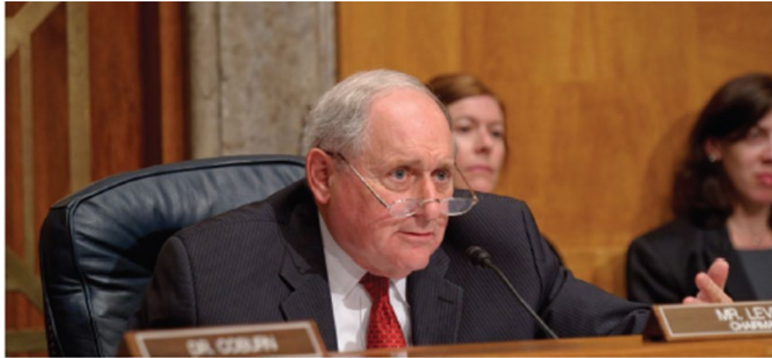
Sen. Carl Levin (D-Michigan)