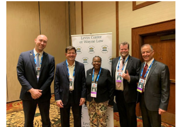
CSG West Annual Meeting