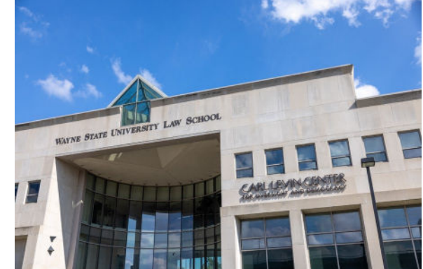
Wayne State Law School