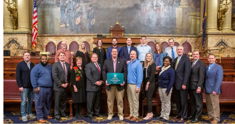
Pennsylvania Oversight Committee