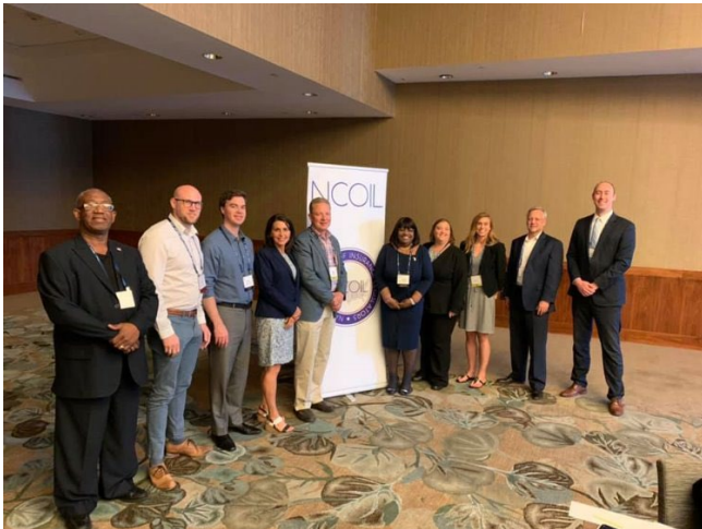
NCOIL Summer Meeting